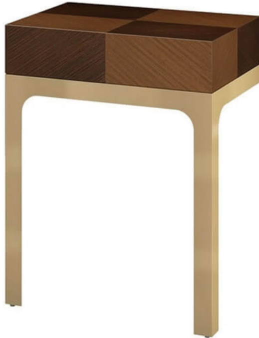
No. HA-17008 ARCHE WALL MOUNTED VANITY